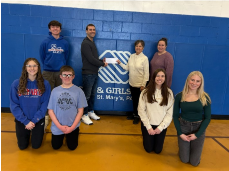
BOYS AND GIRLS CLUB