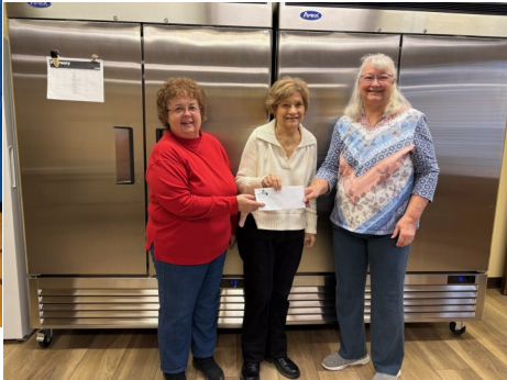
BOWLS OF LOVE