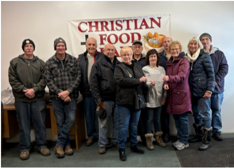
CHRISTIAN FOOD BANK