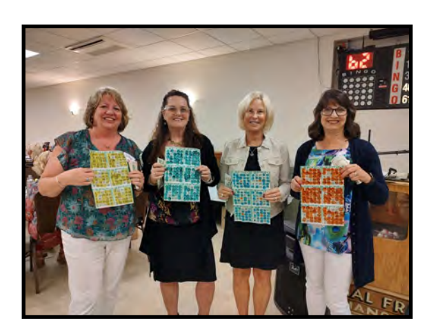
And that's a good bingo!

NETWORKING WITH OUR FELLOW PHILANTHROPISTS