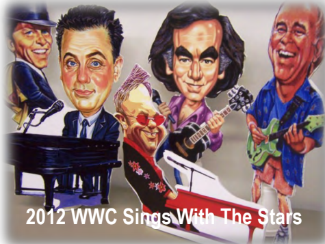
2012 WWC Sings With The Stars