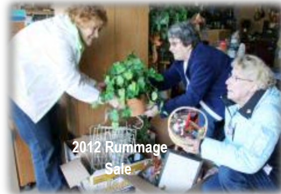
2012 Rummage Sale