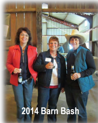
2014 Barn Bash