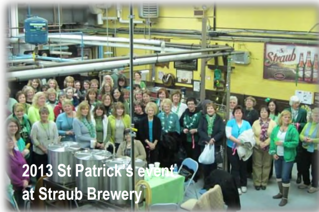
2013 St Patrick's event at Straub Brewery