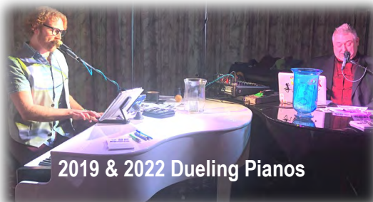
2019 & 2022 Dueling Pianos