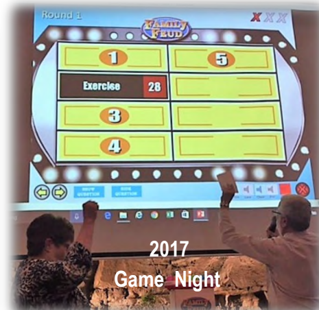
2017 Game Night